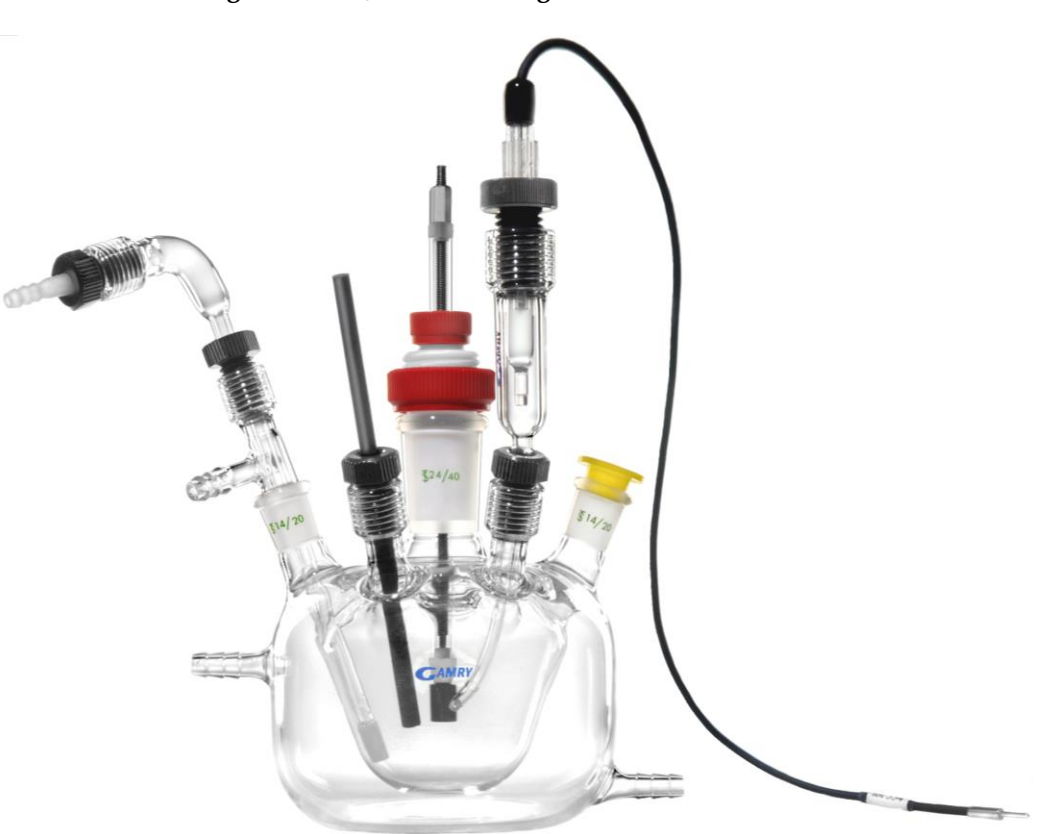
Figure 2. The Jacketed Configuration of the EuroCell.

A given ACE-Thred<sup>™</sup> size can only accommodate objects with a specific diameter. A #7 ACE-Thred<sup>™</sup> is specified to work with object with a diameter between 6.5 mm and 7.5 mm. If you need to add non-standard options to your EuroCell kit, make sure you are aware of this restriction.