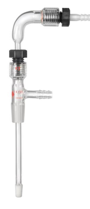
Figure 3. Gas Bubbler Assembly

The standard gas bubbler assembly consists of four pieces: the Gas Flow Adapter, the Gas Bubbler Tube, a #7 ACE-Thred<sup>™</sup> nut, and an ACE-Thred<sup>™</sup>-To-Hose adapter. A photograph of these pieces is in Figure 3.