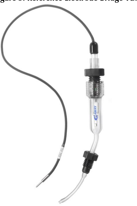
Figure 5. Reference Electrode Bridge Tube.

Figure 5 shows the EuroCell Bridge Tube and Reference Electrode. Note the placement of the O-rings. These O-rings are critical in sealing the ACE-Thred<sup>™</sup> fittings holding this assembly together.