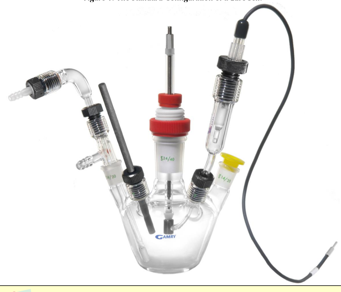
Figure 1. The Standard Configuration of a EuroCell.

Caution: In vacuum work in a chemical laboratory, ground-glass joints are often greased. This is unnecessary with the EuroCell, and may even cause problems if the grease gets into the test solution or on an electrode. Never grease any of the ground glass joints on your EuroCell.