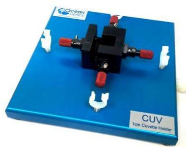
Figure 4: Ocean Optics CUV-ALL-UV cuvette holder.