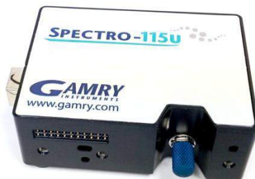
Figure 1: Spectro-115U spectrometer