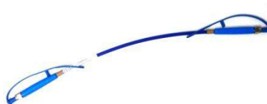
Figure 3: Single fiber patch cord with dust caps.