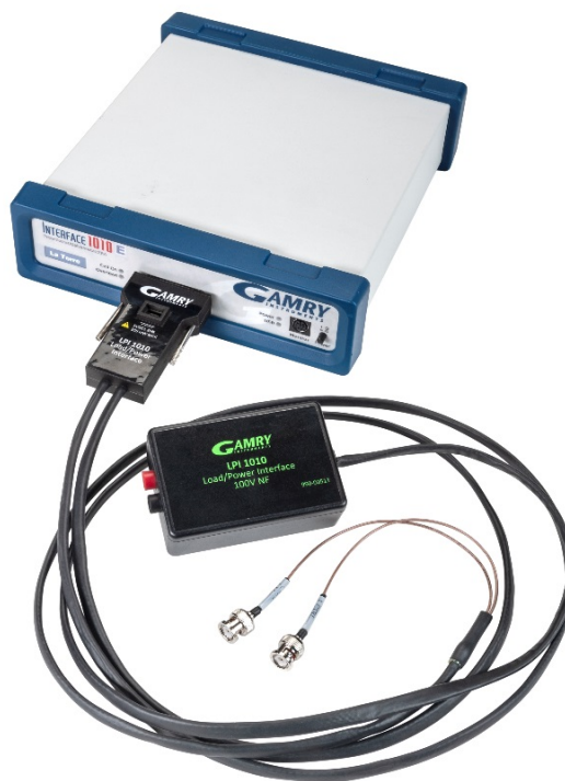
Representative image of Gamry Interface 1010E and LPI1010 100V NF.

A full LPI1010 system will consist of an Interface 1010E, LPI1010 (10, 100, or 1000V model) and power supply or load. Gamry Instruments can supply complete systems including a Power Supply. Older Interface 1010Es will require an upgrade at the factory before they can operate an LPI1010. Customers using their own loads or power supplies may require a custom configuration file and calibration cells. Contact Gamry or your local distributor for further details on these systems and situations.