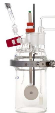
Flat Specimen Holder in the Multiport Corrosion Cell.

Made from tough, durable PEEK, the holder can withstand temperatures up to 80 C. Contact is made on the front of the sample through the use of Pogo pins.