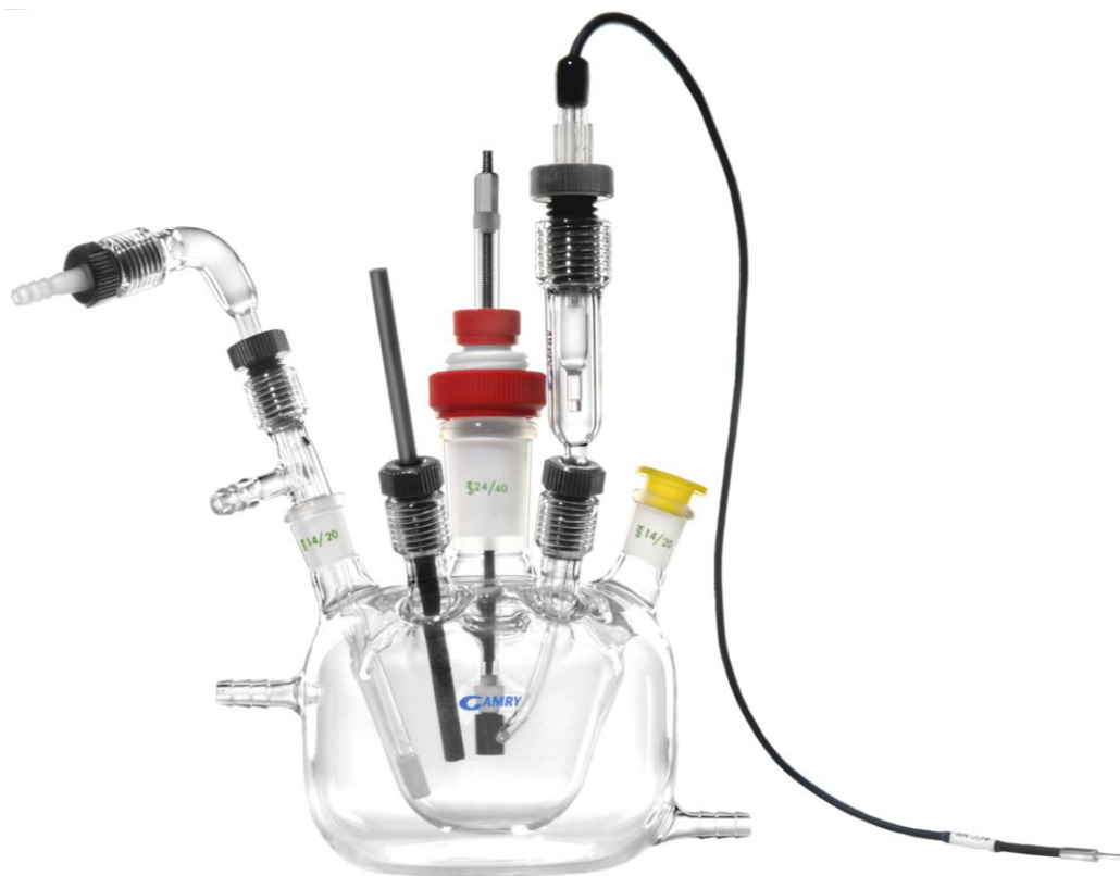
Figure 2. The Jacketed Configuration of the EuroCell.

A given ACE-Thred™ size can only accommodate objects with a specific diameter. A #7 ACE-Thred™ is specified to work with object with a diameter between 6.5 mm and 7.5 mm. If you need to add non-standard options to your EuroCell kit, make sure you are aware of this restriction.