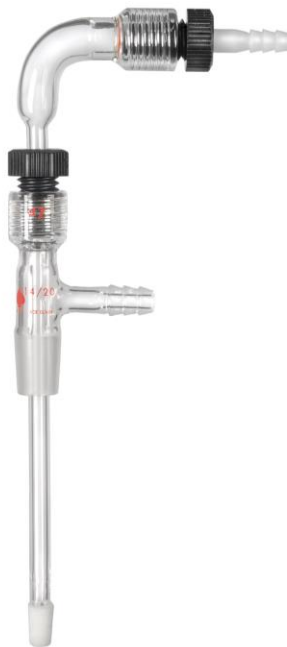
Figure 3. Gas Bubbler Assembly

Figure 3 is representative of the Gas Bubbler used for purge only (no blanketing). A plastic hose-barb is shown connected to the Gas Bubbler Tube, using the ACE-Thred™-To-Hose adapter. The other end of this hose is connected to a source of purge gas.