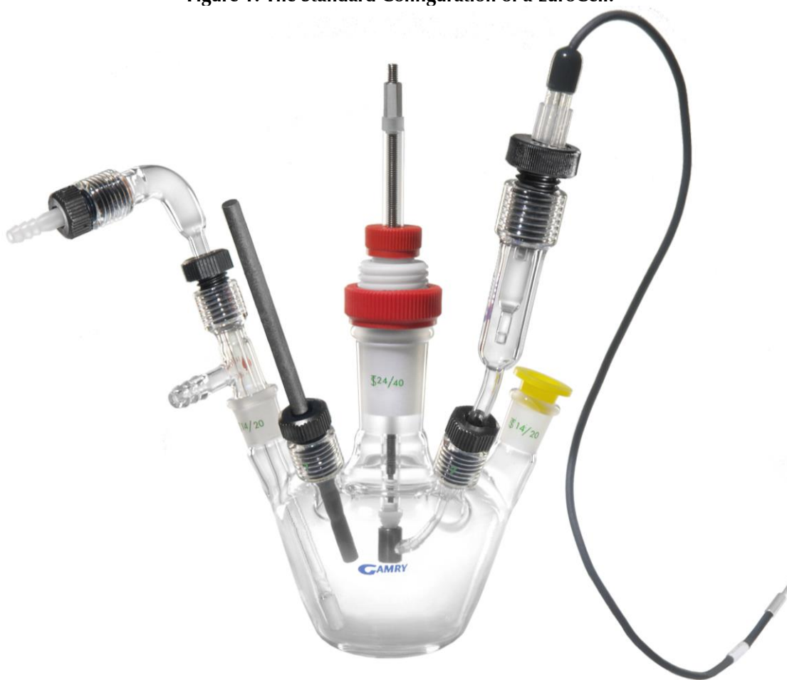
Figure 1. The Standard Configuration of a EuroCell.

Caution: In vacuum work in a chemical laboratory, ground-glass joints are often greased. This is unnecessary with the EuroCell, and may even cause problems if the grease gets into the test solution or on an electrode. Never grease any of the ground glass joints on your EuroCell.