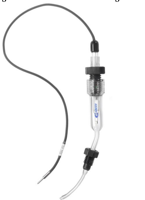
Figure 5. Reference Electrode Bridge Tube.

EuroCell does not include a reference electrode, because different tests may call for different reference electrode types. The reference electrode shown in Figure 5 is Gamry's standard saturated calomel reference electrode (SCE) P/N 930-00003. Gamry also offers an Ag|AgCl Reference (P/N 930-00015) and a Hg|Hg 2 SO 4 reference (P/N 930-00029). Contact your local Gamry sales representative if you need a new or a replacement electrode.