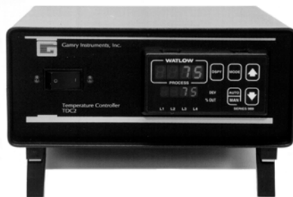
TDC2 Temperature Controller