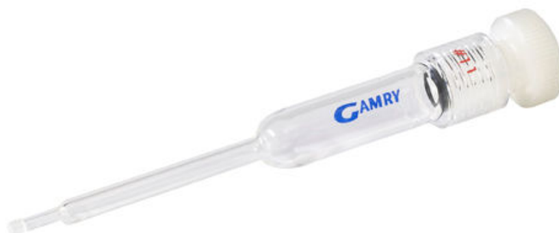
Figure 3 Reference Bridge Tube

Many experiments do not require a “true” reference electrode to be run. If a pseudo- or quasi-reference electrode is sufficient you do not need to use the reference bridge tube.