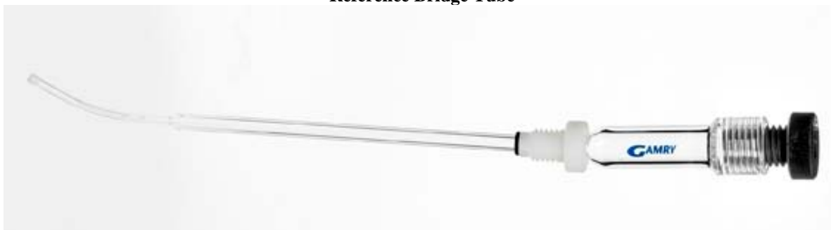
Figure 3 Reference Bridge Tube

Insert the reference electrode into the #11 thread at the upper end of the bridge tube. It must contact the test solution inside the tube. Various reference electrodes that work with this system are available. Contact us for details.