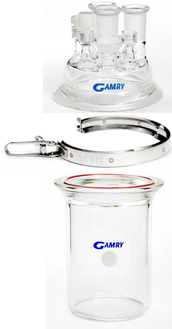
Figure 2 Main Cell Assembly

CAUTION: The cell requires very modest clamping force. If you are having difficulty closing the clamp loosen the bar and try again. Do not force the clamp or tighten it beyond what is necessary to keep the top from sliding/rotating against the bottom (and even that degree is unnecessary in many cases). Overtightening can result in damage to the cell.