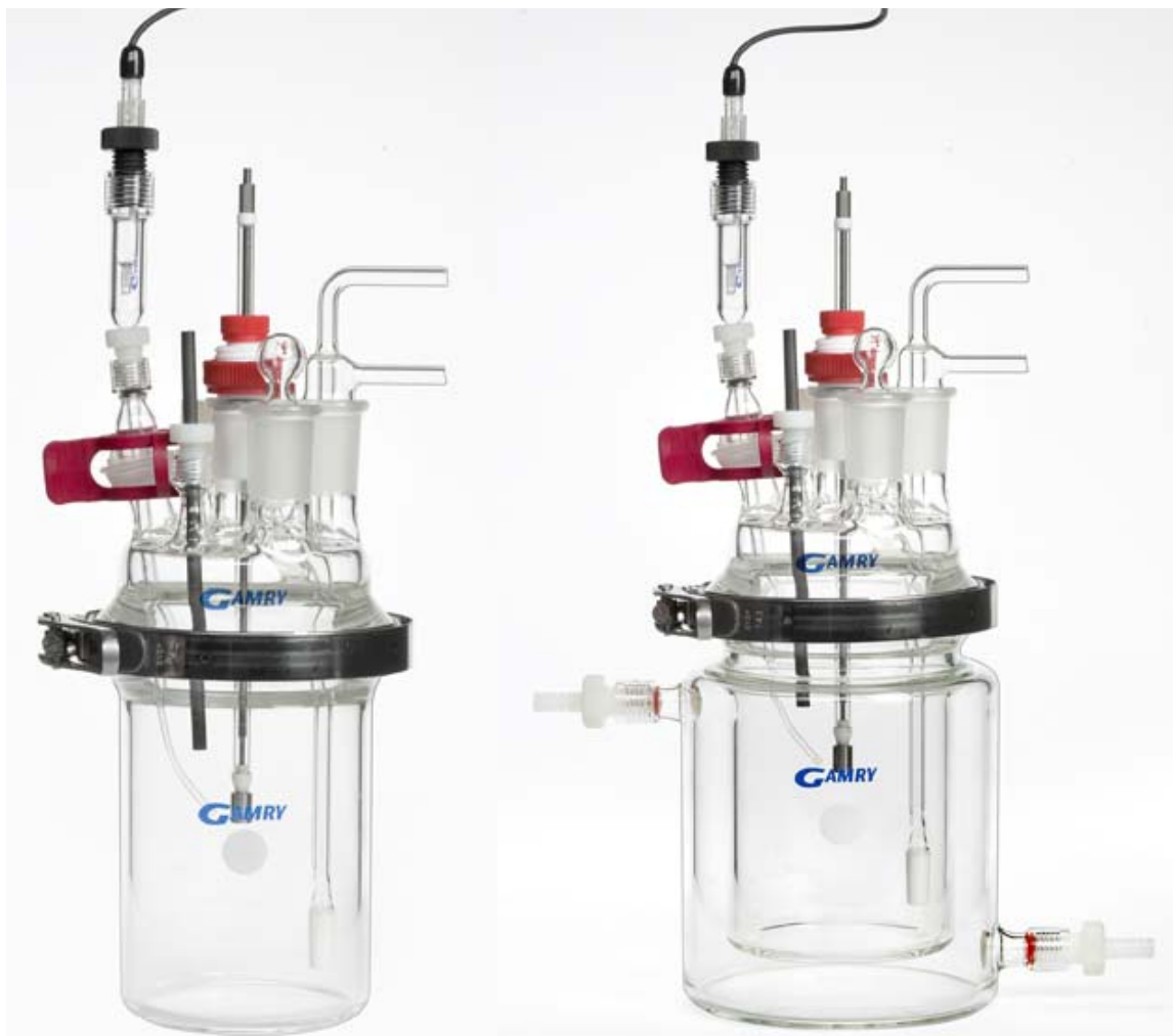
Figure 1 Assembled Cell: Standard and Jacketed Versions

The MultiPort includes a number of ACE-Thred connectors used for a wide variety of functions. #7 ACE-Thred connectors are particularly common. ACE-Thred fittings are designed to seal cylindrical objects into the cell. These objects can include glass tubes, glass plugs, thermometers, and plastic electrode bodies. ACE-Threds are designed to be tightened with finger pressure only.