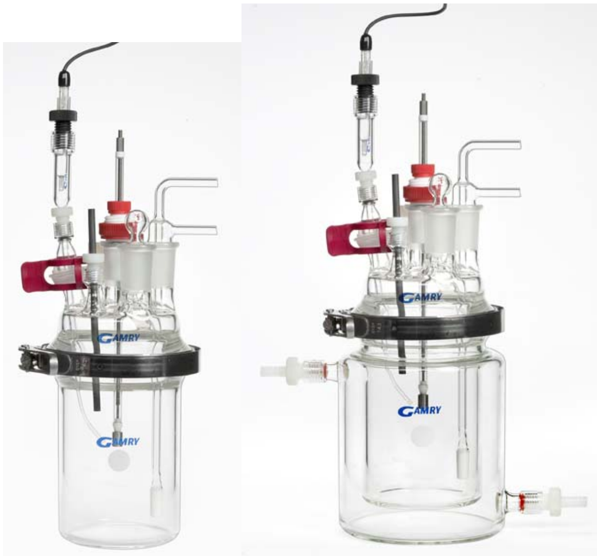
Figure 1 Assembled Cell: Standard and Jacketed Versions

The MultiPort includes a number of ACE-Thred connectors used for a wide variety of functions. #7 ACE-Thred connectors are particularly common. ACE-Thred fittings are designed to seal cylindrical objects into the cell. These objects can include glass tubes, glass plugs, thermometers, and plastic electrode bodies. ACE-Threds are designed to be tightened with finger pressure only.