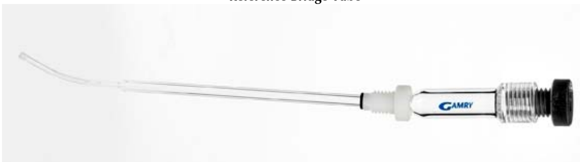
Figure 3 Reference Bridge Tube

Insert the reference electrode into the #11 thread at the upper end of the bridge tube. It must contact the test solution inside the tube. Various reference electrodes that work with this system are available. Contact us for details.