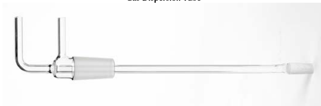
Figure 4 Gas Dispersion Tube

The vent function is critical. Regardless of whether gas is flowing through or over the test solution, you must provide a way for it leave the cell. If you, do not, the gas may not flow or worse, the cell may burst apart unexpectedly. Not providing a vent for the escape of purge gas is a very common and often dangerous “mistake” made when setting up an electrochemical cell.