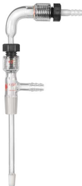
Figure 3. Gas Bubbler Assembly

Figure 3, is representative of the Gas Bubbler used for purge only (no blanketing). A plastic hose barb is shown connected to the Gas Bubbler Tube using the ACE-Thred To Hose adapter. The other end of this hose is connected to a source of purge gas.