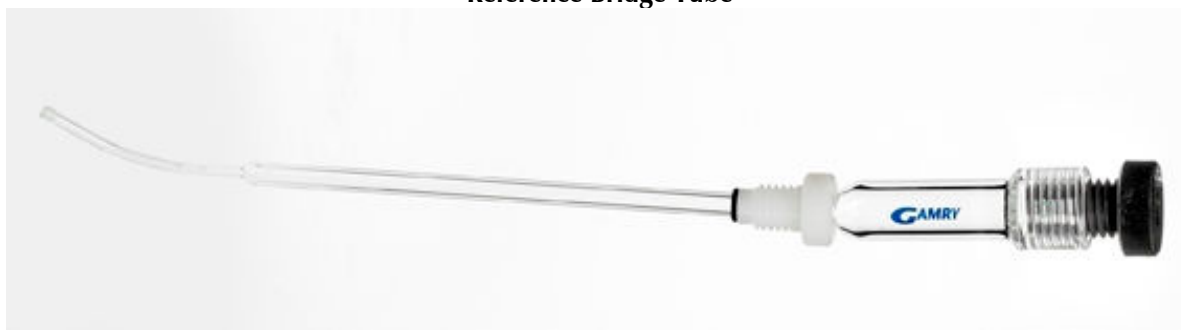
Figure 3 Reference Bridge Tube

Insert the reference electrode into the #11 thread at the upper end of the bridge tube. It must contact the test solution inside the tube. Various reference electrodes that work with this system are available. Contact us for details.