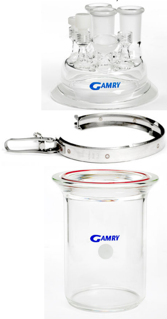
Figure 2 Main Cell Assembly

CAUTION: The cell requires very modest clamping force. If you are having difficulty closing the clamp loosen the bar and try again. Do not force the clamp or tighten it beyond what is necessary to keep the top from sliding/rotating against the bottom (and even that degree is unnecessary in many cases). Overtightening can result in damage to the cell.