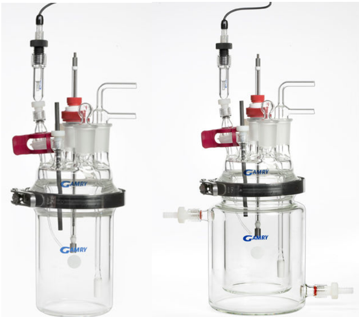
Figure 1 Assembled Cell: Standard and Jacketed Versions

The MultiPort includes a number of ACE-Thred connectors used for a wide variety of functions. #7 ACE-Thred connectors are particularly common. ACE-Thred fittings are designed to seal cylindrical objects into the cell. These objects can include glass tubes, glass plugs, thermometers, and plastic electrode bodies. ACE-Threds are designed to be tightened with finger pressure only.